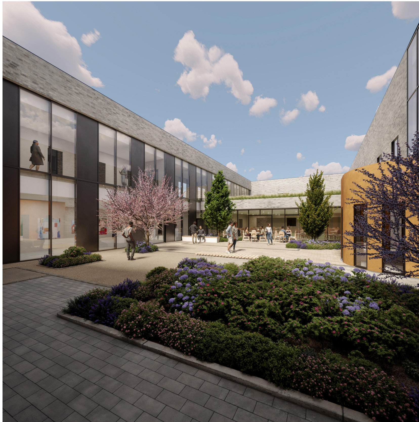
200-bed Adult In-Patient Hospital Public Canteen Courtyard

COPYRIGHT: The design and details shown on this drawing are applicable to The Named Project only and may not be; reproduced, modified or relayed in whole or part or be used for any other project or purpose without the prior written permission of TOT Architects with whom copyright resides.